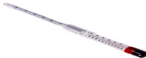
Figure 3: Hydrometer

This instrument is used to measure the specific gravity (relative density) of liquids. In this case, it is used to measure the ratio of the density of the liquid to the density of the water.