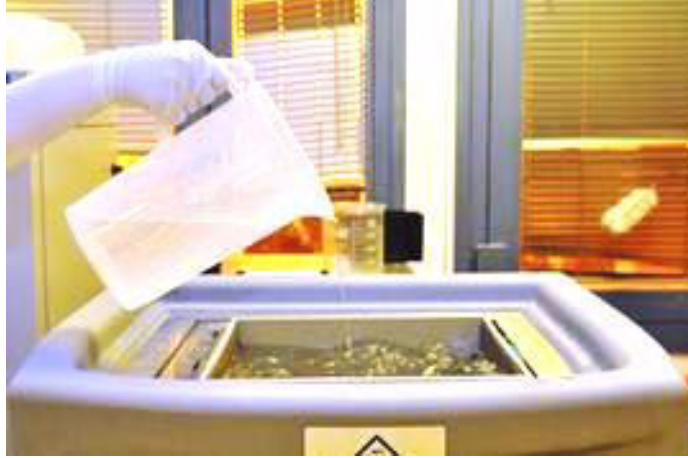
Figure 1: Pouring water into the DT3 CleanStation