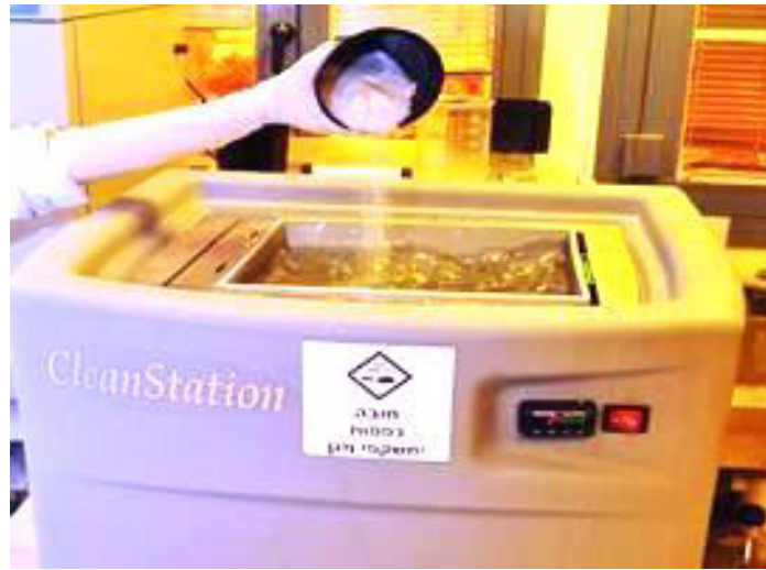
Figure 2: Adding chemicals